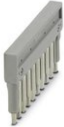
Plug-in bridge, pitch: 5.2 mm, number of positions: 10, color: gray

Please be informed that the data shown in this PDF Document is generated from our Online Catalog. Please find the complete data in the user's documentation. Our General Terms of Use for Downloads are valid ( http://phoenixcontact.com/download )